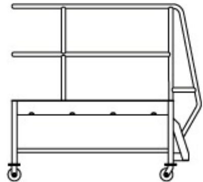
Platform with ladder and optional casters.