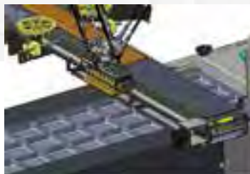
Robot uses vacuum to pick 8 product pieces at once and moves toward the pocket.