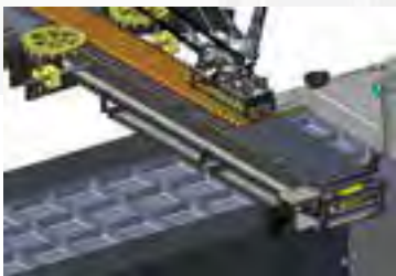
Robot tracks with moving infeed and positions over product.