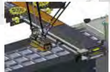
As the robot moves toward the pocket, the end effector groups and separates the product pieces prior to placing them in the pocket.