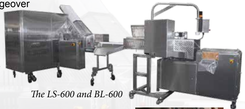
The LS-600 and BL-600