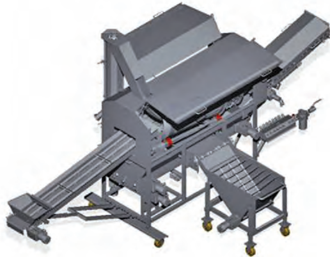
MPADVANTAGE™ Drum Breader with low profile hopper