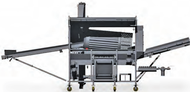
MPADVANTAGE™ Drum Breader- right-side view