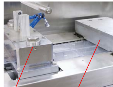
Matched Metal Cutting